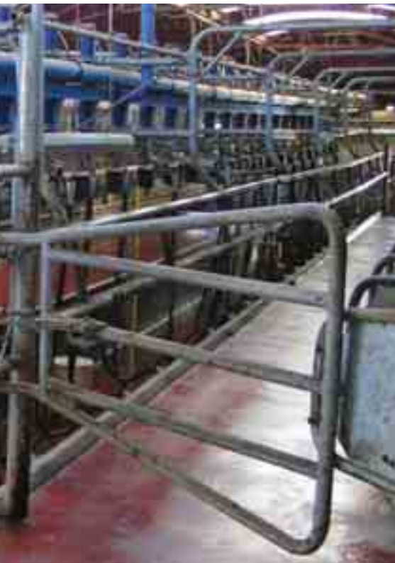
Figure 1 shows a section of a test report with the main vacuum and airflow results.

The working vacuum is 47kPa, which is fine. The plant gauge (vacuum gauge on the machine) is reading the same as the test gauge so the plant gauge reading is correct (i.e. zero error).